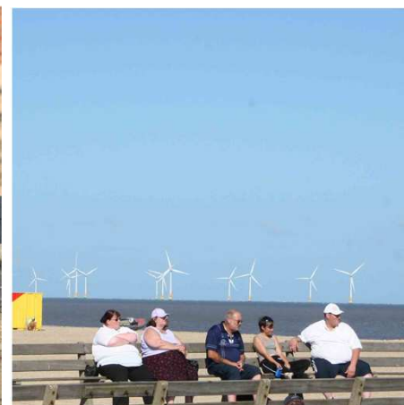
Sustainable & prosperous communities