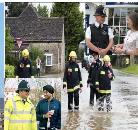
Safer & stronger communities